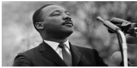
Martin Luther King, Jr. Day Monday, January 18, 2021