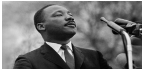
Martin Luther King, Jr. Day Monday, January 17, 2022

Drop donations off @ BLC Monday-Wednesday 9-2:30PM or on Sunday Mornings. ~Thank you!~